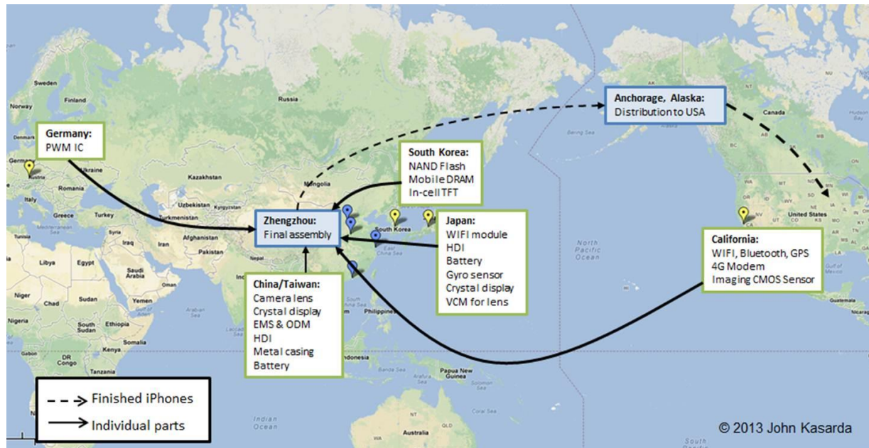
Exhibit 8: Global Supply Chain – Apple iPhone 5

As of April 2014, another 14 smartphone manufacturers and suppliers were establishing their base in the broader Zhengzhou Airport Economy Zone (ZAEZ) with 150 million smartphones expected to be manufactured there in 2014. A number of new projects up to US $1 billion each are currently under construction in the ZAEZ. These include, among others, Amer International Group, Cainiao Networks, Fair Friend Precision Machinery Park, IBM, and Microsoft. In 2013, there were 48 new major projects signed, worth a total of US $24.3 billion. 27