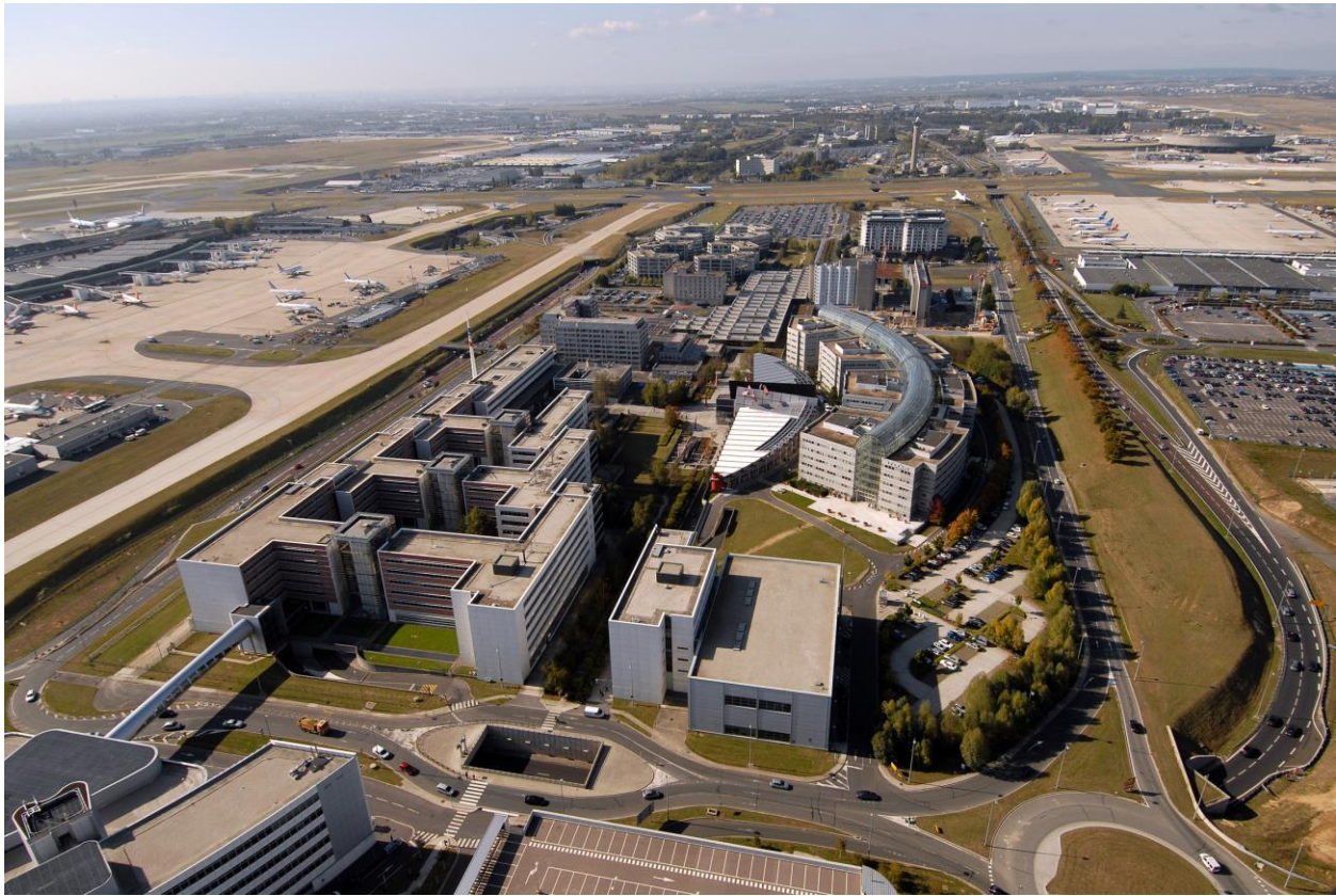
Exhibit 4: Paris Charles de Gaulle (Roissypole: CDG's Airport City)