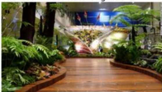
Themed indoor natural gardens