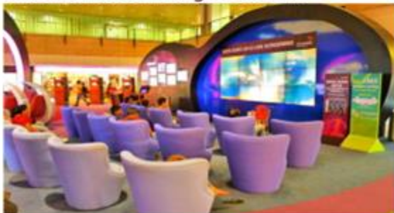
“Xperience Zone”: Latest Sports and Movies on Large Screens