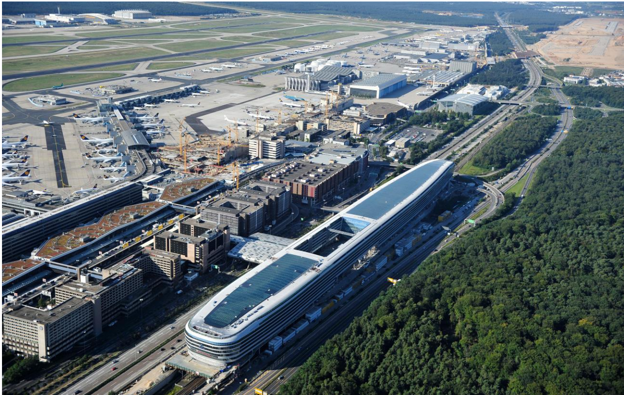
Exhibit 5: Frankfurt Airport “The Squire” (21 st -Century Multimodal Office Hub)