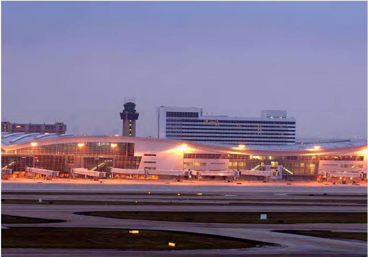
Exhibit 2: Dallas-Fort Worth Grand Hyatt Hotel (21 st Century Virtual Corporate Headquarters)