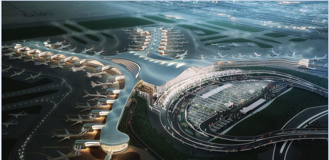
Exhibit 10: Abu Dhabi’s New Midfield Terminal (Exterior Above, Interior Below)

The terminal’s planners and developers promise it will not only be the largest and most visually striking aerodrome in the world but also the most efficient from an aeronautical and energy standpoint. They are accomplishing the latter by incorporating environmental features of Masdar, the sustainable zero-carbon city under construction nearby.